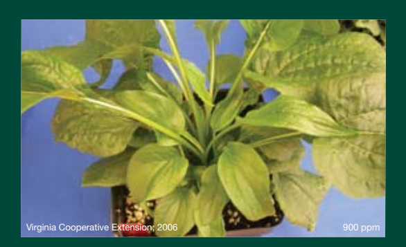
Testing of Configure on Echinacea demonstrates increased branching.