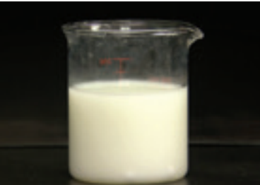
Even after two hours, Clipper SC stays in suspension