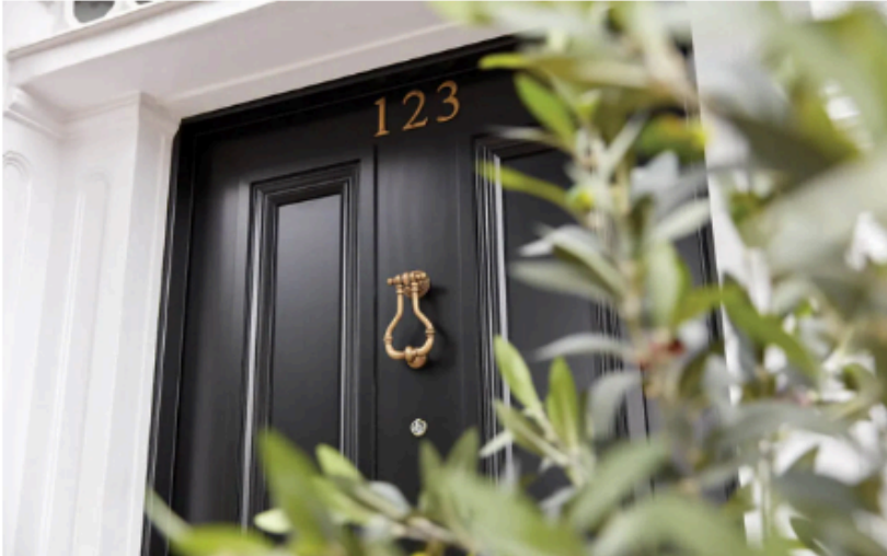
Finishing touches: consider what hardware you can (and want to) utilise with your door