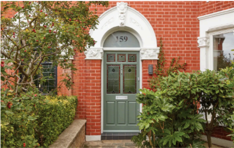
The right fit: a Victorian front door from London Door Company