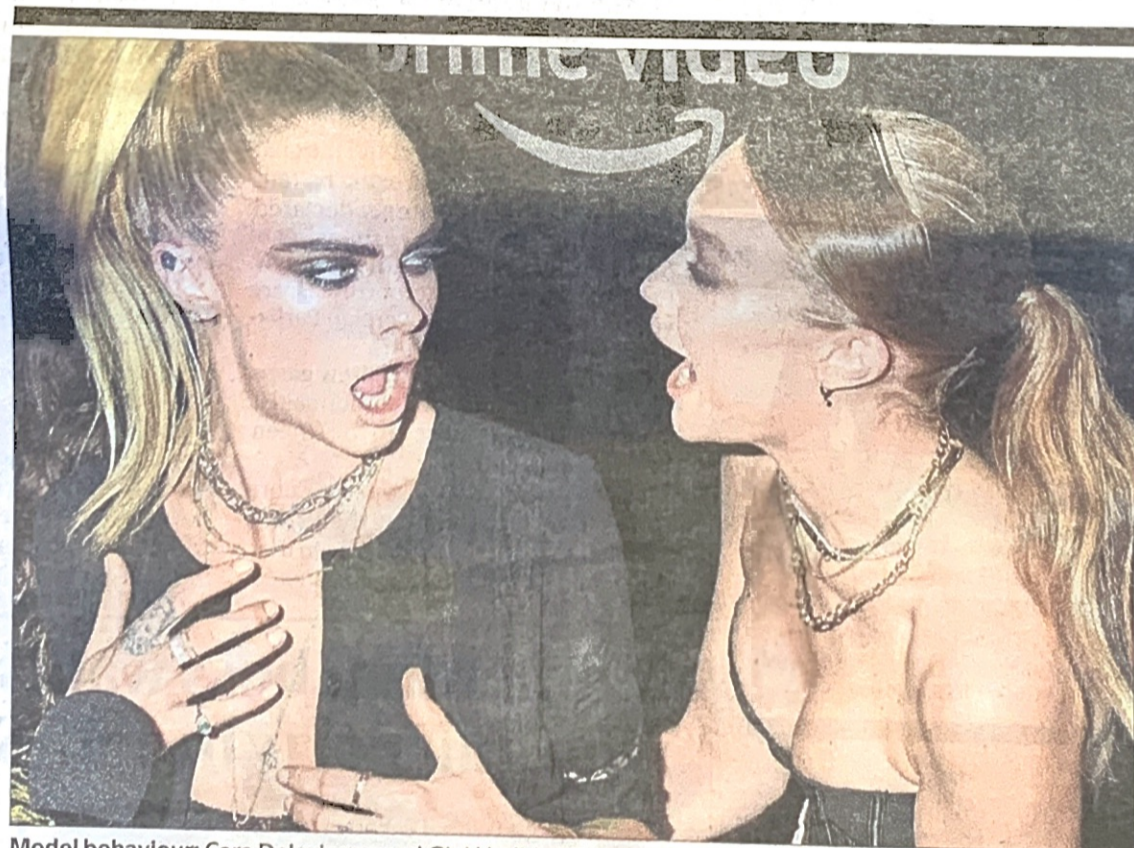
Model behaviour: Cara Delevingne and Gigi Hadid at Rihanna's lingerie show in NYC FULL STORY: Page 3