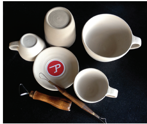
RIGHT Propeller collaborated with a local artisan to create its own line of handcrafted ceramics, all thrown, glazed and fired in the Propeller in-house studio.