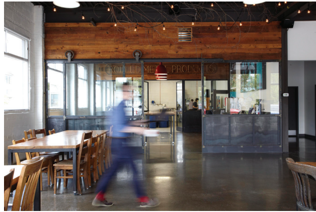
LEFT A view of the roasting room from Propeller's cafe.