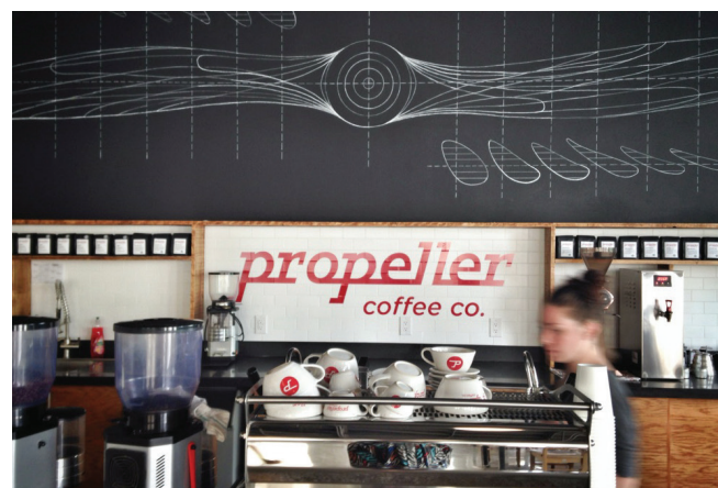
Propeller’s coffee bar.