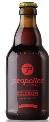
MIDDLE Propeller developed and launched its own cold brew during summer 2015.