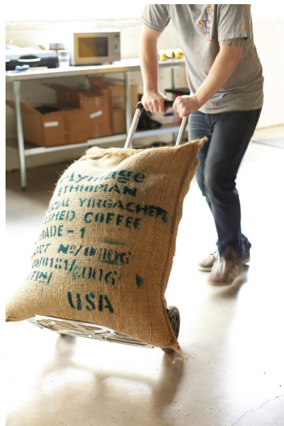
At work in the roastery.