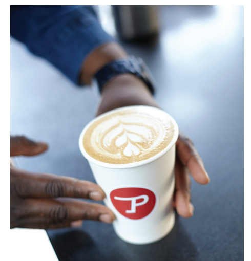
Coffee at Propeller.