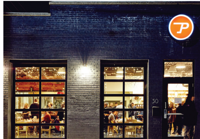
Propeller Coffee Co. in Toronto.