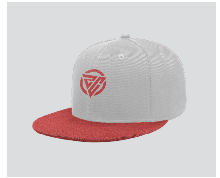
Flat Bill Cap