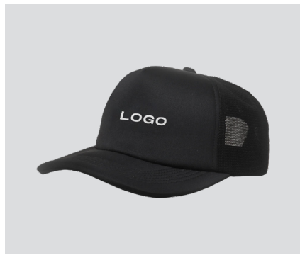
Slightly Curved Cap