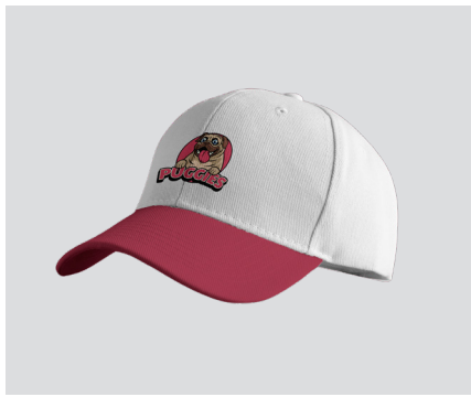
Curved Bill Cap