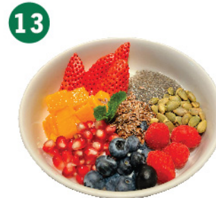
13 SUPER BOWL Natural yoghurt topped with fresh seasonal berries, mango, pomegranate, chia jelly, toasted flax seeds & pumpkin seeds. $58