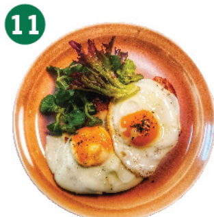
11 2 EGGS ON TOAST YOUR WAY Served on sourdough, but choose white or brown bread if preferred $48