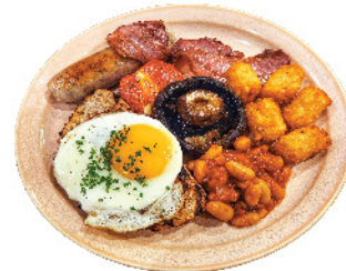
5 HALF ENGLISH BREAKFAST Half portion of the Full English, free-range egg, streaky bacon, Cumberland sausage, portobello mushroom & house-made beans with sourdough toast and tater tots.