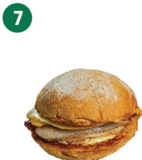
7 BACON & EGG BAP $48