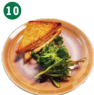
10 HAM & CHEESE TOASTIE Cooked sliced ham, Gruyère cheese and Dijon mustard $48