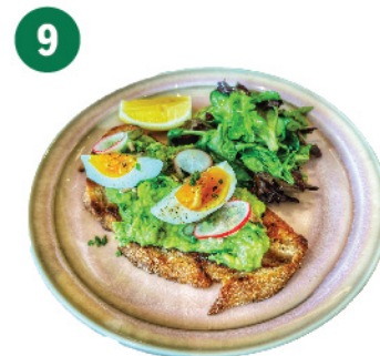
9 SMASHED AVO ON TOAST Five-minute egg, baby radish, celery cress and toasted seeds on sourdough $68