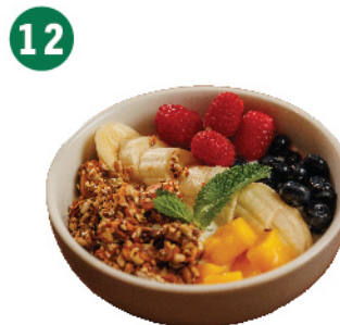
12 YOGHURT & GRANOLA Natural yoghurt served with baked muesli, banana and fresh berries. $58