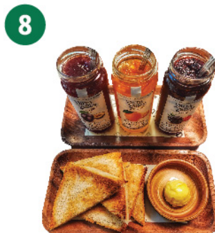
8 TOAST WITH BUTTER & JAM Served on sourdough, but choose white or brown bread if preferred $48