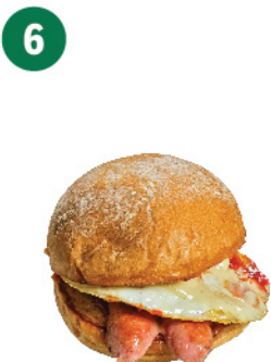
6 SAUSAGE & EGG BAP $58