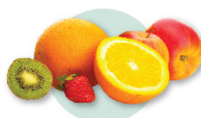
A PIECE OF FRESH FRUIT