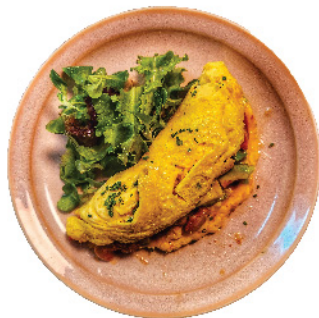
1 FAB OMELETTE $67 A 3-egg free-range plain omelette