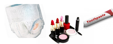
Diapers and personal hygiene products.