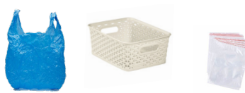
Large plastic products like bins or trays, pouches, plastic bags, and toys.