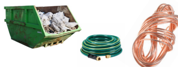
Scrap metal, wires and cables, home and construction waste.