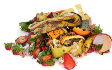
Organic, kitchen, yard and animal waste.