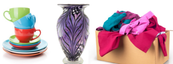
Textiles, housewares, windows, ceramics, and other reusable items.