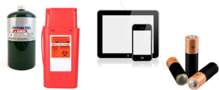
Hazardous waste like paint, gas or aerosol cans, sharp objects, electronics and batteries.