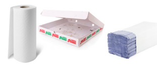
Napkins, paper towels and food soiled cardboard.