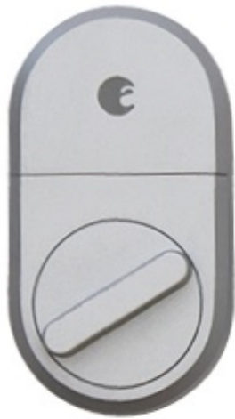
Smart Lock Pro (4 AA batteries included)