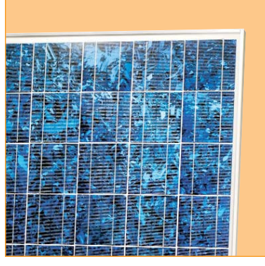
Solder-coated grid results in high fill factor performance under low light conditions.

This poly-crystalline 205 watt module features 12.6% module efficiency for an outstanding balance of size and weight to power and performance. Using breakthrough technology perfected by Sharp's 45 years of research and development, these modules use a textured cell surface to reduce reflection of sunlight, and BSF (Black Surface Field) structure to improve conversion efficiency. An anti-reflective coating provides a uniform blue color and increases the absorption of light. Common applications include office buildings, cabins, solar power stations, solar villages, radio relay stations, beacons, traffic lights and security systems. Ideal for grid-connected systems and designed to withstand rigorous operating conditions, Sharp's ND-205U1 modules offer maximum power output per square foot of solar array.