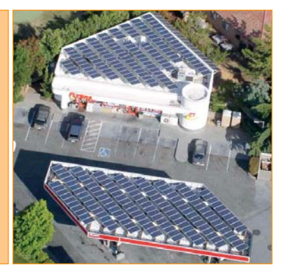
Sharp multi-purpose modules offer industry-leading performance for a variety of applications.