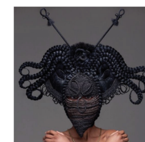
Delphine Diallo Photographer