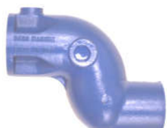
CR 20 97924