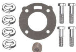
CR 20 96560P