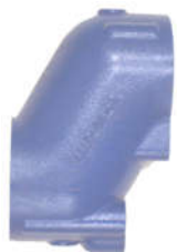
CR 20 97772