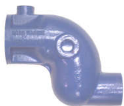
CR 20 96560