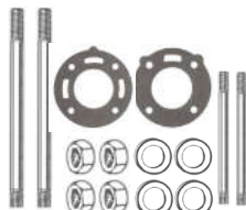
CR 20 97772P