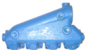
CR 1 97993