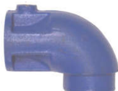
CR 20 97386