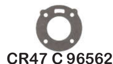
CR47 C 96562