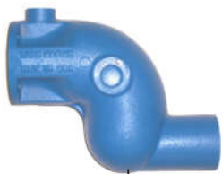
CR 20 98068