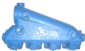
CR 1 97992