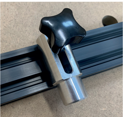
Slide the t-nut into the fence as shown below and screw the Fence Dog into the t-nut using the thumbscrew.