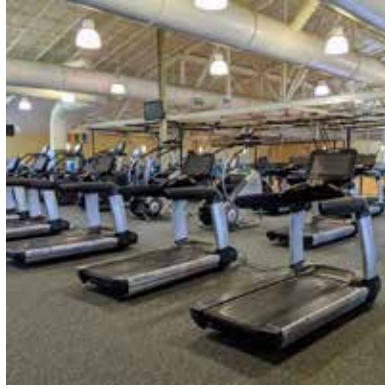
Municipal Facilities Township of Upper St. Clair - Pittsburgh, PA