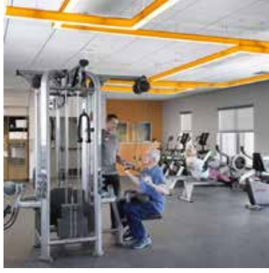
Senior Living Riverwoods Durham - Durham NH