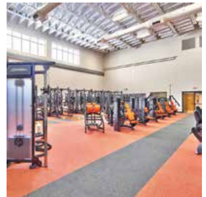
K-12 & High School Churchville - Chili High School, NY