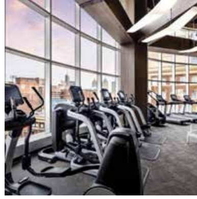
Hospitality The Westin - Buffalo, NY