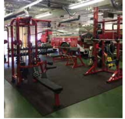
Police and Fire Copley FD - Copley Township, OH