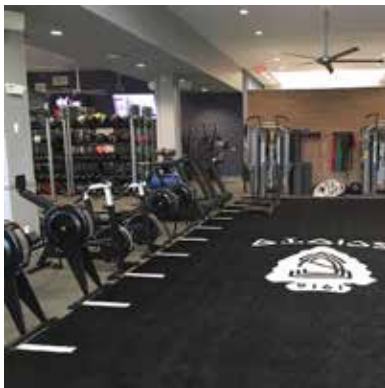
Country Clubs Scioto Country Club - Columbus, OH