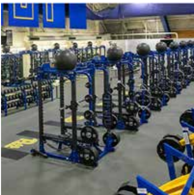
Athletics University of Pittsburgh, PA