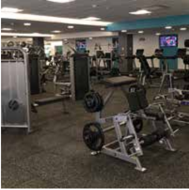
Corporate Wellness Nationwide - Columbus, OH