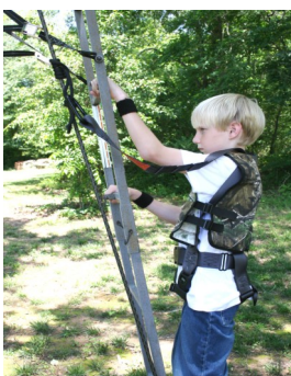
Figure 1 HSS Strongly recommends the use of the HSS Life Line with the Lil' Tree Stalker Safety System!