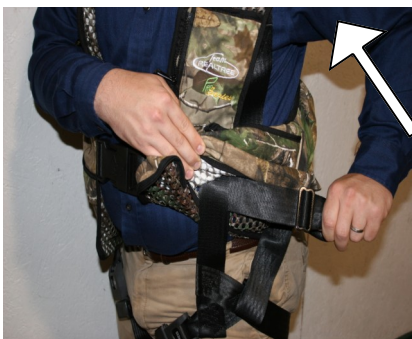
Figure 1. Locate harness adjustment under left pocket & above leg buckle.