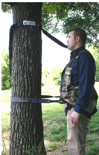
Figure 7 The tree strap and harness's tether MUST be attached to the tree for double attachment.