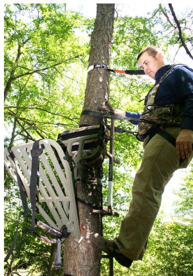
Figure 8 Hang the treestand below the lineman's climbing strap while keeping the strap AND tether/tree strap attached to the tree. Stay doubly attached!