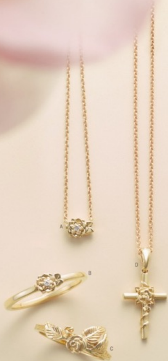
A. 88041 Natural Diamond Flower Necklace, 0.015 ctw, 7.2x5.2mm, 14K Yellow, 23, 16-18", $515 | B. 126079 Natural Diamond Flower Ring, Size 7, 0.015 ctw, 14K Yellow, 33, $655 | C. 4194 Floral Ring, 9mm, 14K Yellow, $699 | D. R50008 Floral Cross Necklace, 24.2x10.9, 14K Yellow, 16-18", $585