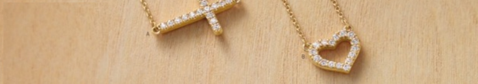
A. R50009 Lab-Grown Diamond Sideways Cross Necklace, 1/4 ctw, 15.5x11, 14K Yellow, $18, $875 | B. 688820 Lab-Grown Diamond Heart Necklace, 1/4 ctw, 10x9mm, 14K Yellow, $18, 16-18", $775 | C. R50011* Lab-Grown Diamond Cross Necklace, 1/4 ctw, 11x2.4mm, 14K White, $18, 18", $775

Our Modern Brilliance® Collection offers beautiful styles set exclusively with lab-grown diamonds at perfect price points.