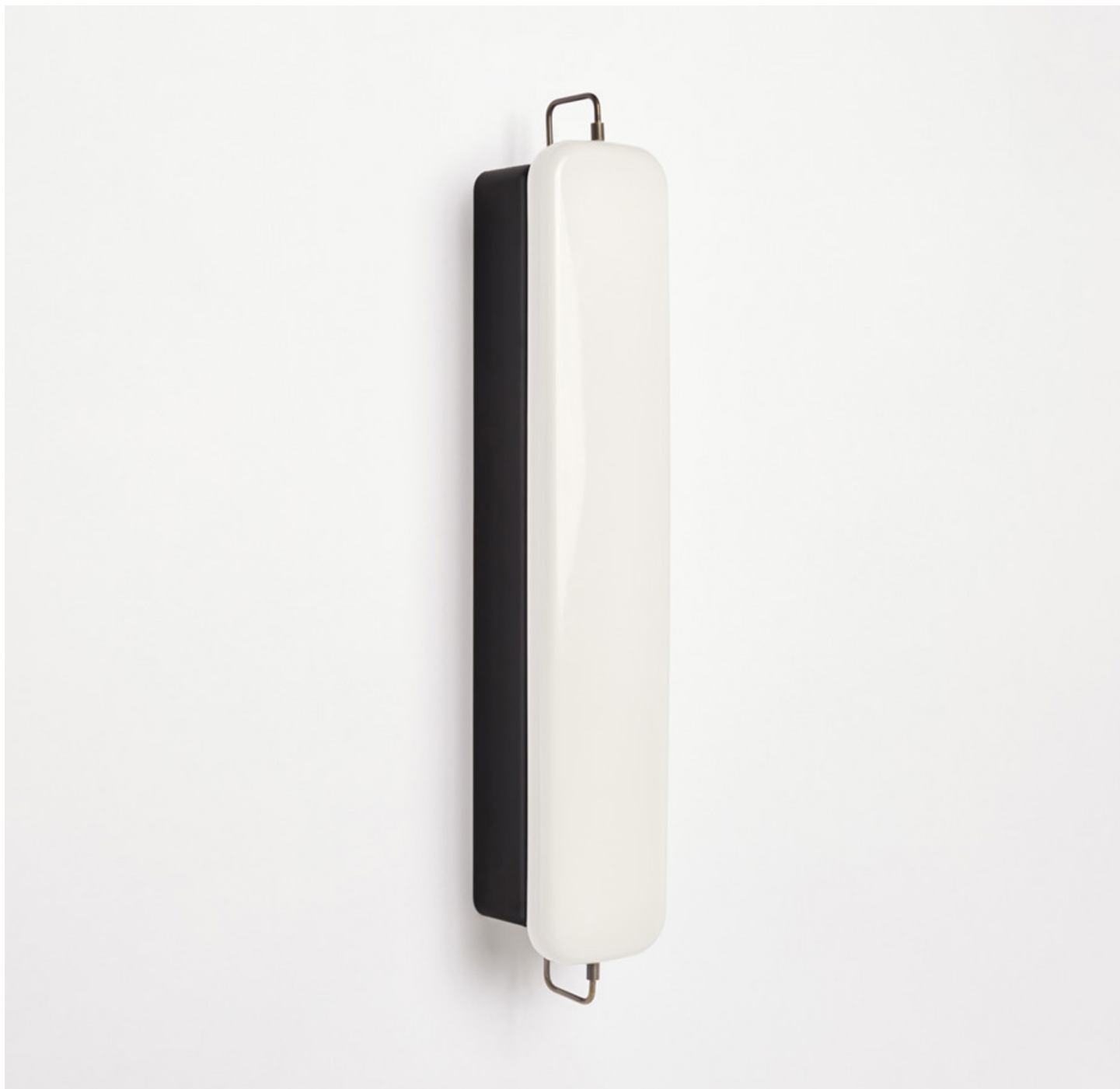
PARK III black enamel