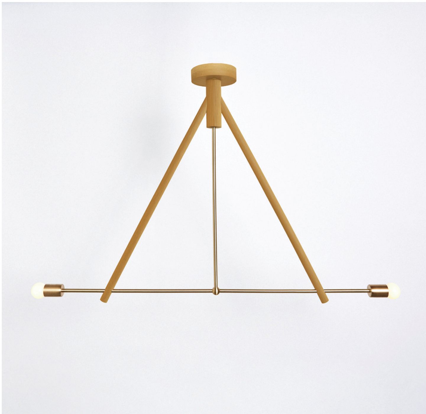
LODGE CHANDELIER II painted yellow