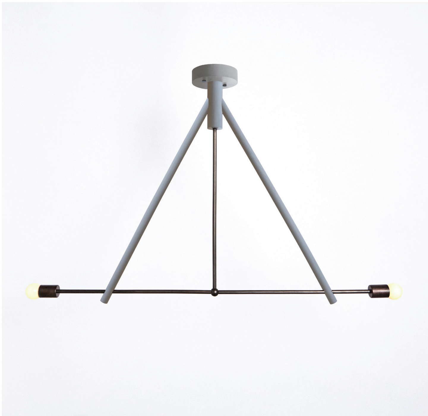
LODGE CHANDELIER II painted gray