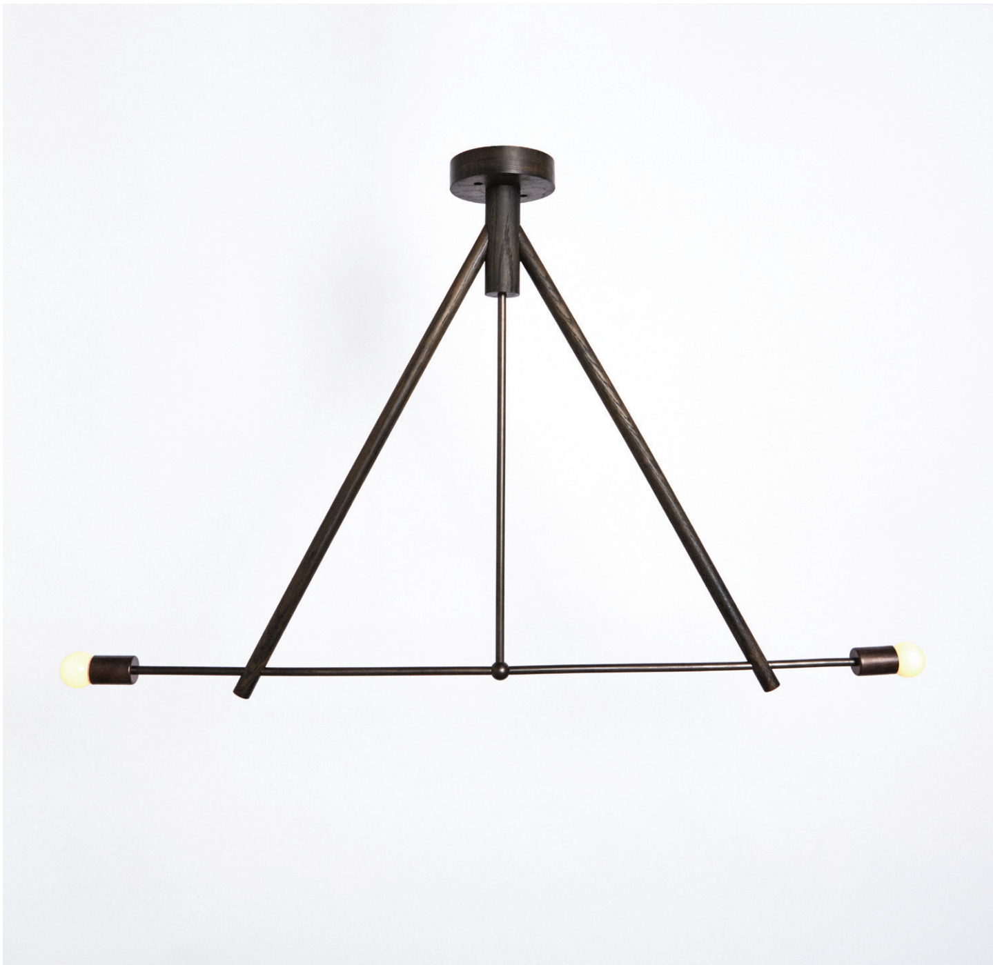
LODGE CHANDELIER II oxidized oak