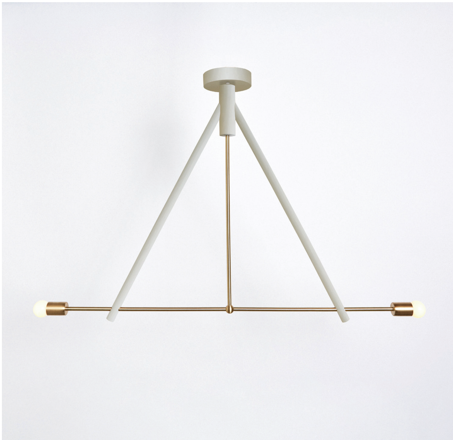
LODGE CHANDELIER II painted white