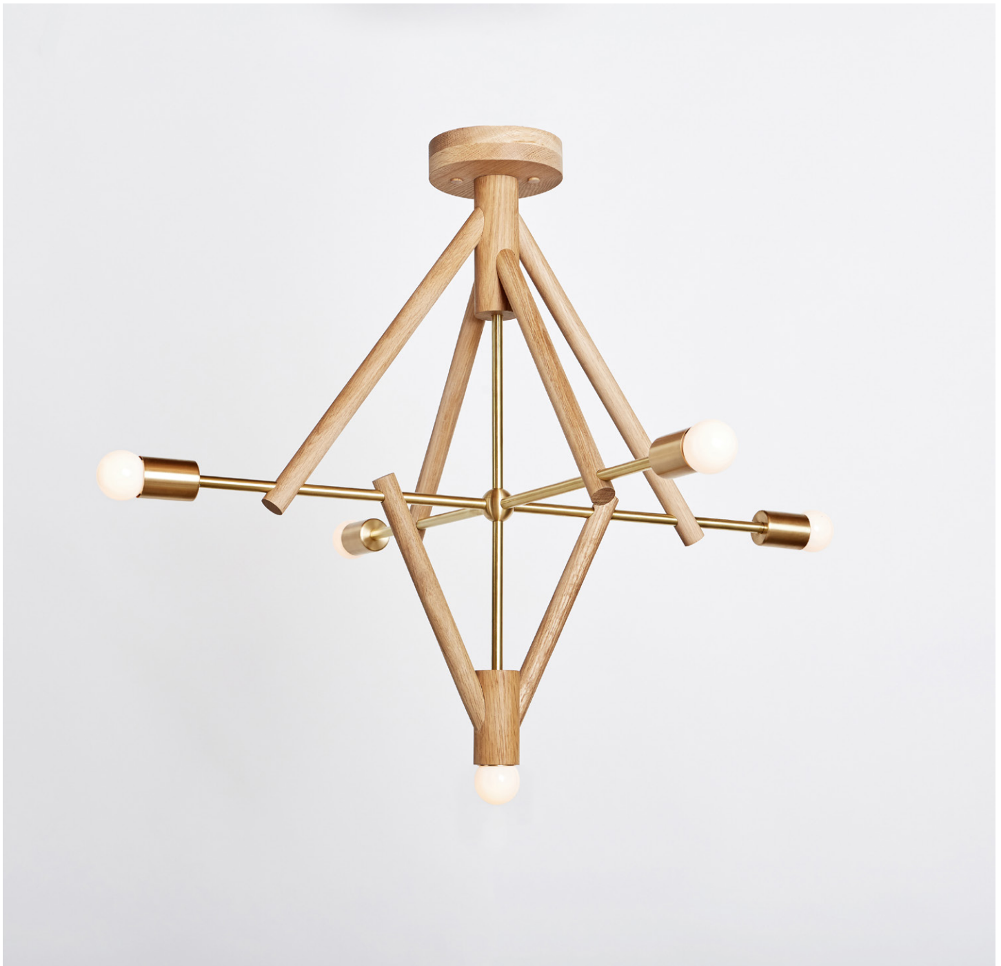
LODGE CHANDELIER V natural oak