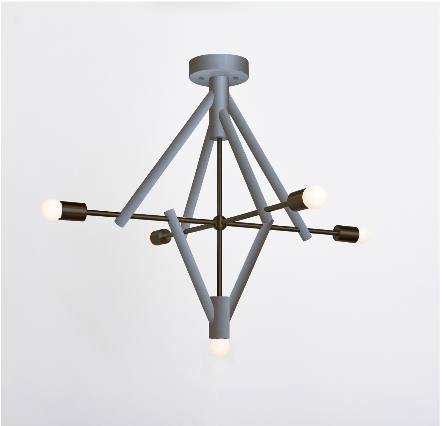
LODGE CHANDELIER V painted gray