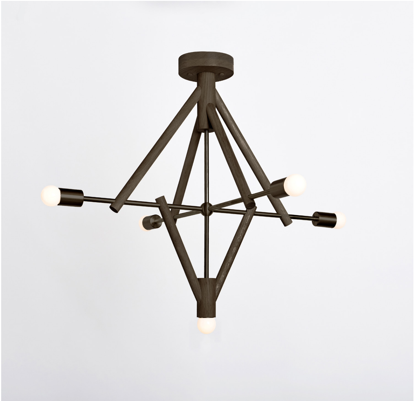
LODGE CHANDELIER V oxidized oak