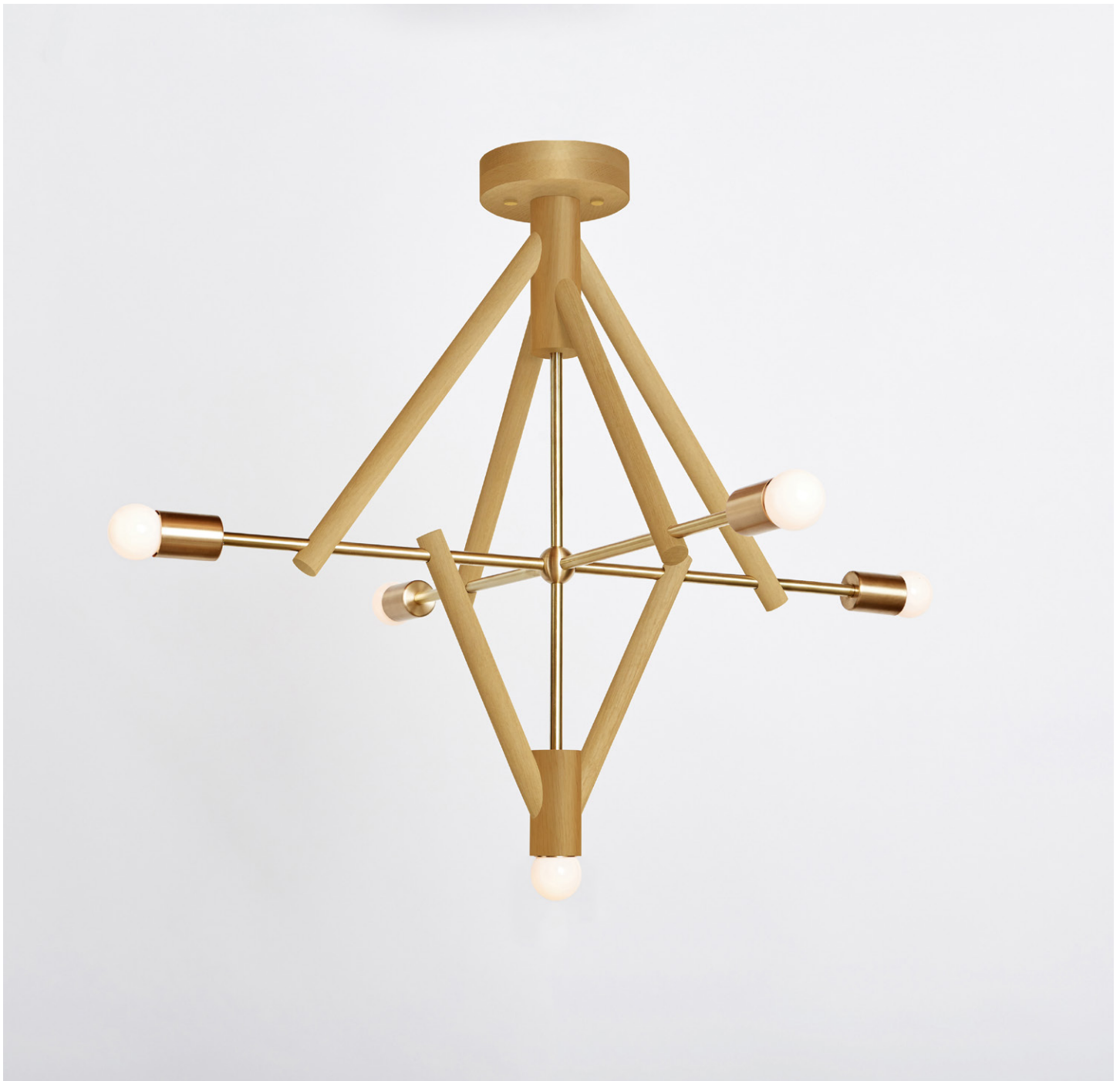
LODGE CHANDELIER V painted yellow