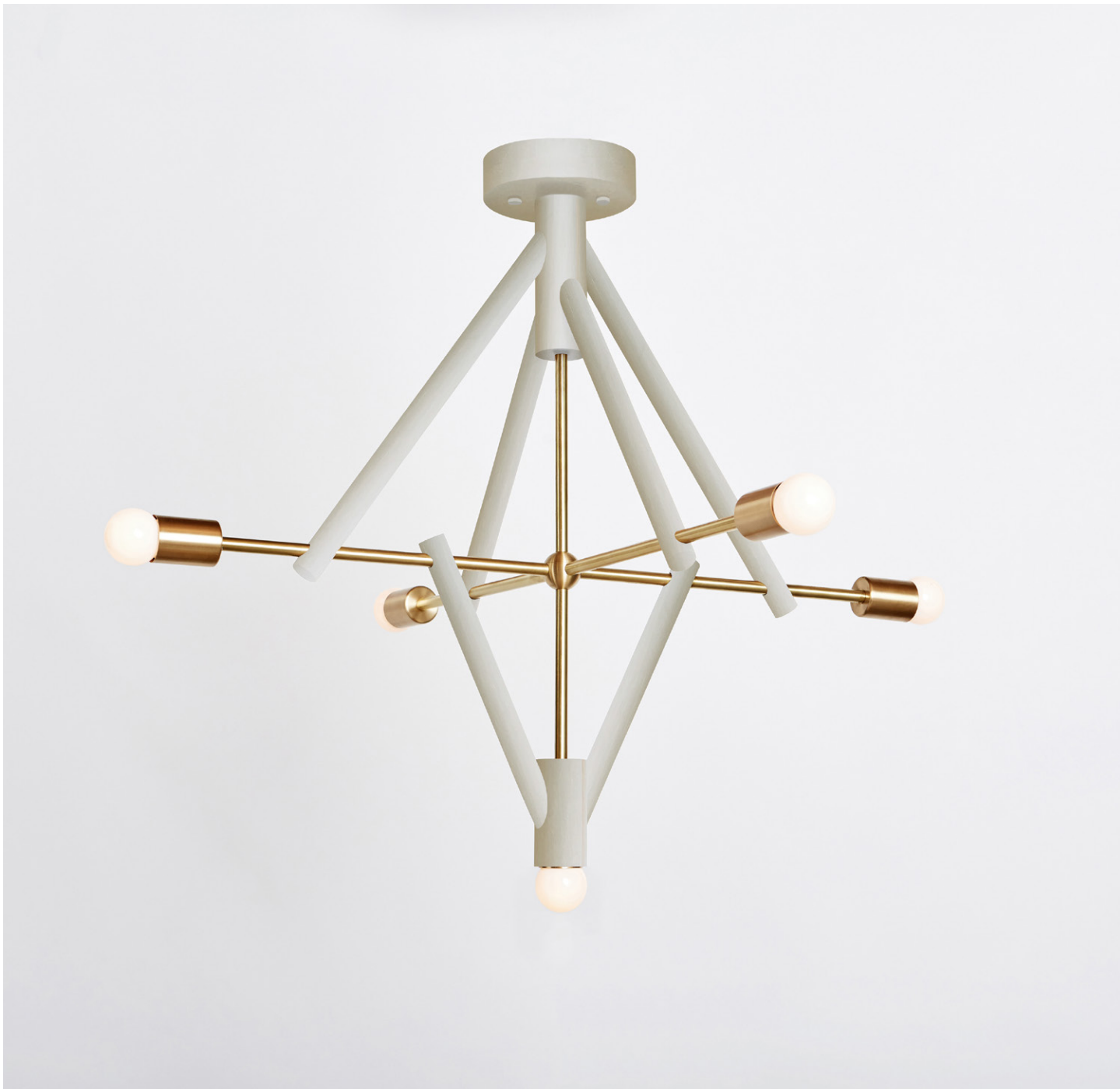
LODGE CHANDELIER V painted white