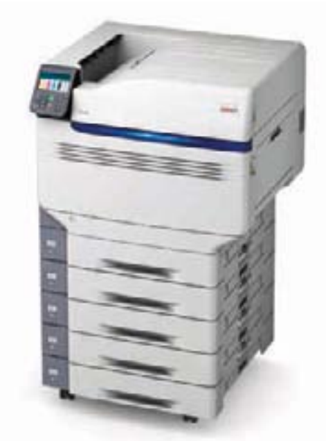
Paper capacity expandable to 2,950 sheets max. (shown with optional 2nd tray and high-capacity feeder with casters)