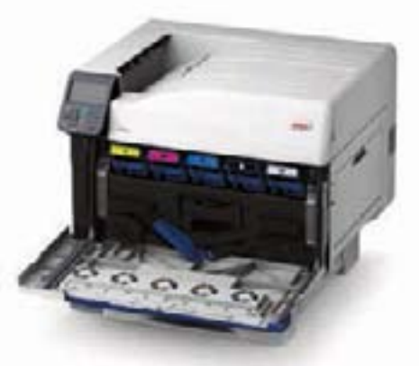
Front-accessible consumables make changing or replacing toner cartridges and image drums quick and easy.