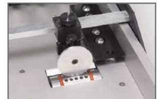
Bottom Vacuum Feed with Register Guide

The COUNT™ KF-250 is ideal for anyone with an existing creasing machine or a multi-directional slitter/cutter/creaser. This machine is ideal for use in applications with heavier stock where standard buckle folders cannot get the job done. The KF-250 provides a clean fold without cracking or bending stocks up to 350 gsm.