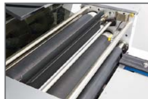
Knife Fold Chassis