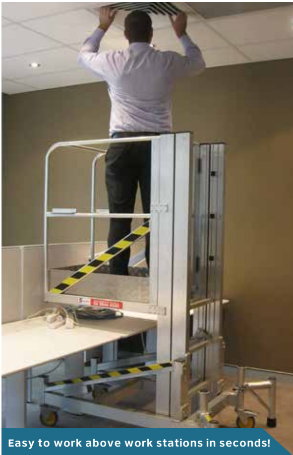
Easy to work above work stations in seconds!

PULLEY SYSTEM IN MAST - LIFT INTO POSITION