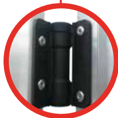
HINGING SAFETY GATE