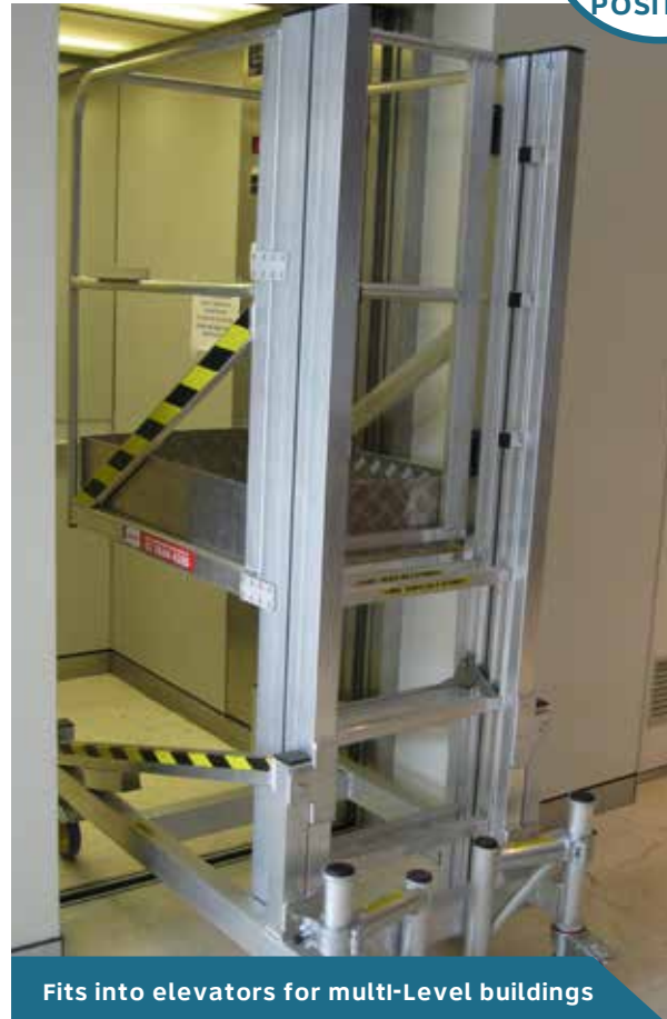
Fits into elevators for multi-level buildings