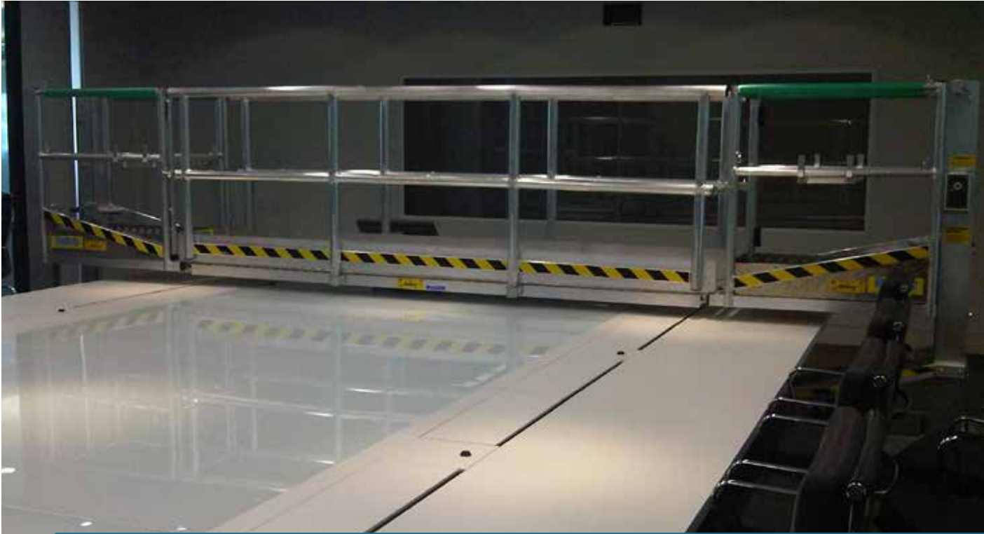
Join 2 Desksurfers to create a safe bridging system to work over wide obstacles