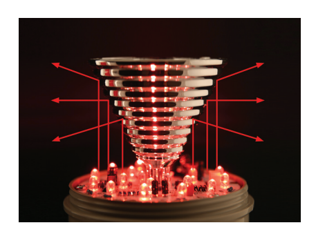
Feature of indirect light diffusing system Indirect light diffusing system emits

intense and constant level of signal lights via multi reflector throughout the lens.