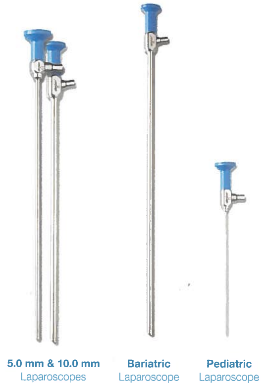
5.0 mm & 10.0 mm Laparoscopes