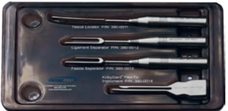
380-0000 KobyGard™ System