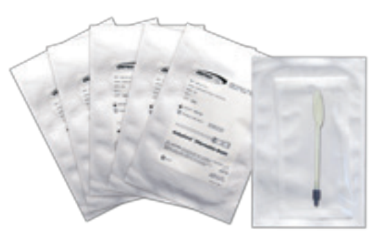
380-0010 KobyGard™ Sterile-Packed Single-Use Blade 380-0006 KobyGard™ Sterile-Packed Single-Use Blade, 6 Pack