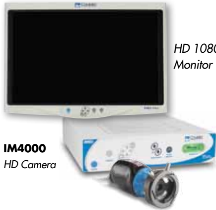
HD 1080p Monitor