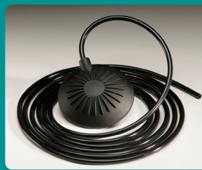
Pneumatic footswitch (included)