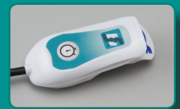
EZLink (sold separately; part: EZLINK01).

Buffalo Filter® is a registered trademark of Buffalo Filter, LLC in the United States and other countries. All other trademarks used herein are the property of their respective owners. ©2014, Buffalo Filter. All rights reserved.