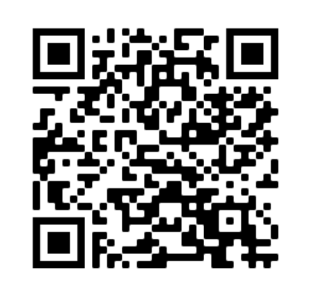
QR Code A Hardware Kit

IMPORTANT! Replace any hardware that is worn or damaged. Always replace nylon lock nuts. To order proper hardware, scan QR Code A.