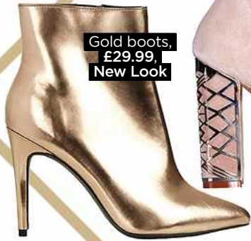
Gold boots, £29.99, New Look

Strut down the aisle in style - team your gorgeous gown with an incredible pair of metallic heeled boots