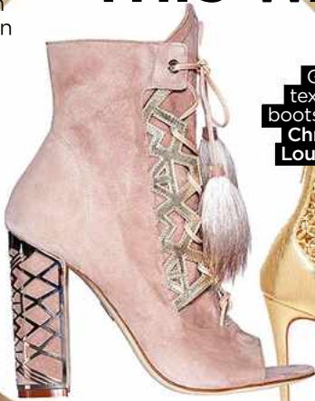
Gold textured boots, £1395, Christian Louboutin