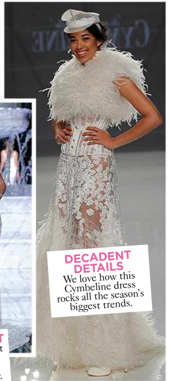
DECADENT DETAILS We love how this Cymbeline dress rocks all the season's biggest trends.