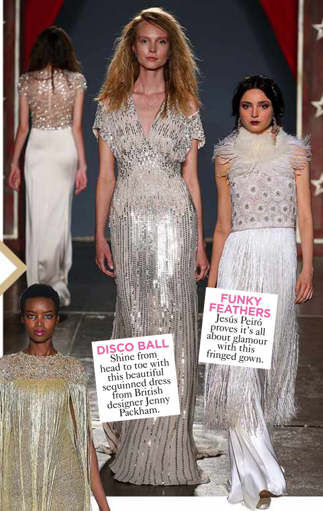
DISCO BALL Shine from head to toe with this beautiful sequined dress from British designer Jenny Packham.