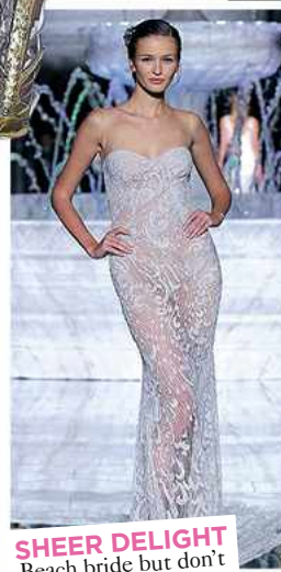
SHEER DELIGHT Beach bride but don't want boho? This Pronovias number could be the answer.