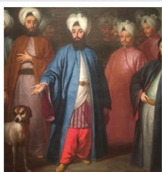
#peramuseum this #istanbul institution has a great collection of both Turkish and Western art