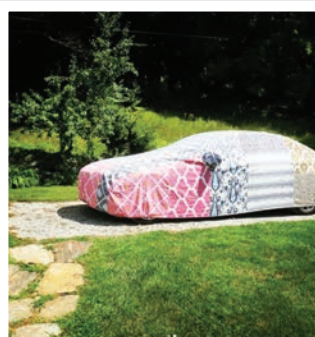
#crazyquilt a car cover made from #johnrobshawtextiles brings my #litchfieldhills driveway to life