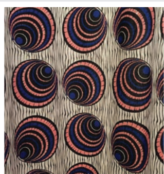
#shellgame mesmerizing Dutch wax prints on display at #tropenmuseum in #amsterdam