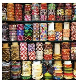
#jaipur bangle shopping in #india is a decidedly colorful experience #designinspiration #sensoryoverload