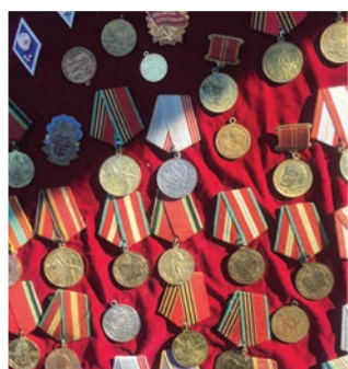
#tbilisi stumbled upon some Russian medals while wandering around Georgia's capital city