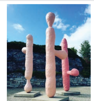
#franzwest the Austrian artist's Les Pommés d'Adam sculptures take center stage at #massmoca