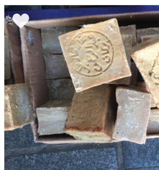
#grandbazaar stocked up on olive soaps from #syria at this huge market in #istanbul