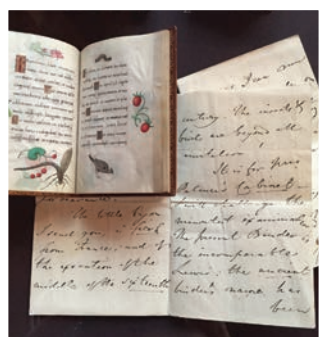
#kolumbamuseum Persian manuscripts caught my eye during a trip to #cologne