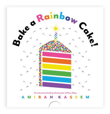
BAKE A RAINBOW CAKE!