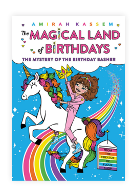
THE MAGICAL LAND OF BIRTHDAYS