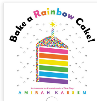
BAKE A RAINBOW CAKE!