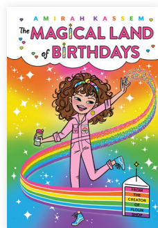
THE MAGICAL LAND OF BIRTHDAYS