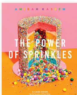
THE POWER OF SPRINKLES