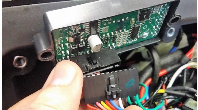
Fig. 7: Connectors separated.