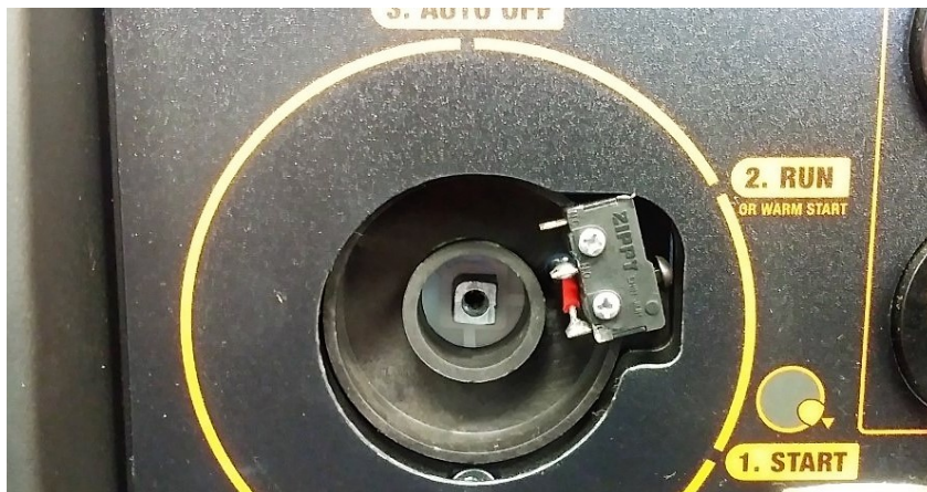
Fig. 4: 3-in-1 knob removed.