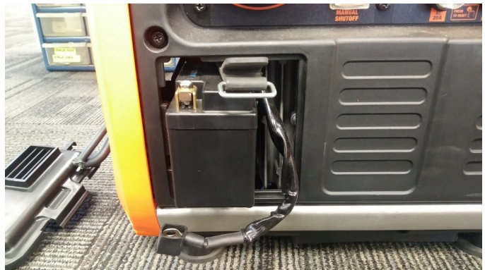
Fig. 2: Negative battery wire disconnected.