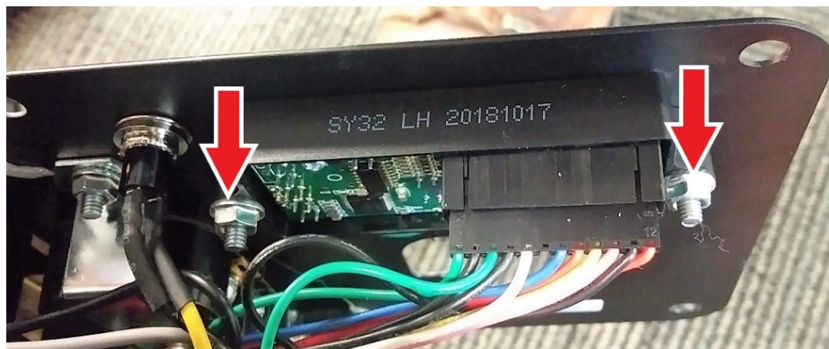
Fig. 5: Remove these nuts.