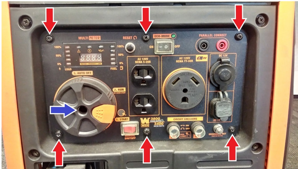
Fig. 3: Remove screws.