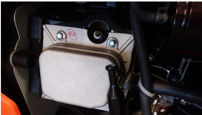
Fig. 1: Spark plug boot disconnected.