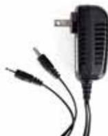
ASA16U08 Output: DC 4.2v, 0.75A*2 Input : AC 100v-240v