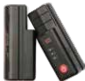
MW-370 3.7volt 2200mAh Lithium-Ion