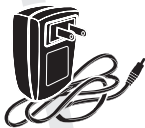
ASA09U03 • Output: DC 8.4v, 1.0A • Input : AC 100v-240v