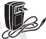
ASA09U03 • Output: DC 8.4v, 1.0A • Input : AC 100v-240v