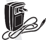
ASA16U17 • Output: 12.6v, 1.6A • Input : AC 100v-240v