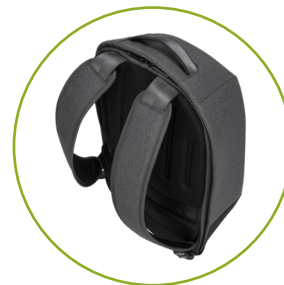
Comfortable ergonomic straps