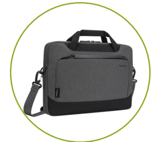
Air mesh shoulder strap