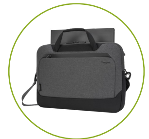
Air mesh shoulder strap