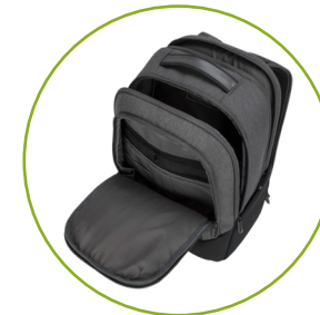
3 main functional compartments