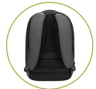
Padded back panel