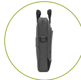
Comfort carry handles