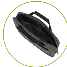
1 main compartment