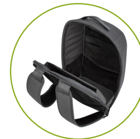
2 main functional compartments