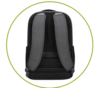
Padded back panel and luggage strap