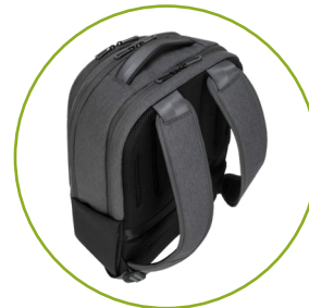
Comfortable ergonomic straps