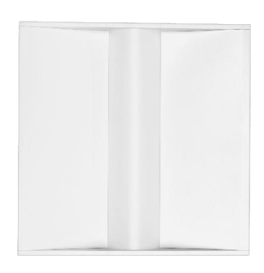
2x2 15W, 19W, 24W and 29W

0-10V dimming comes standard. Suitable for use with LED dimmers.