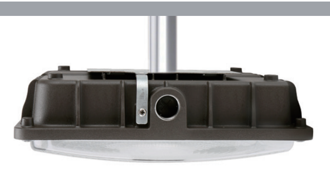
Conduit Pendant Mount*