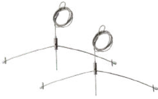
Chain suspending mount kit (Standard)