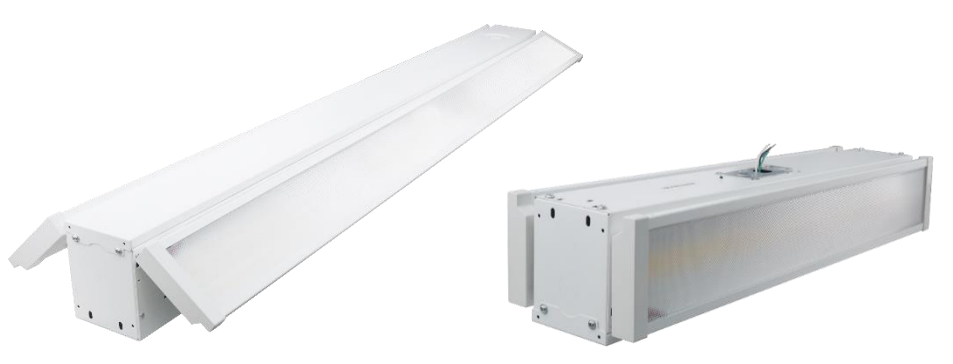
290W / 320W / 350W

0-10V dimming comes standard. Suitable for use with LED dimmers.