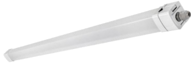
4 Foot 30W / 40W / 50W