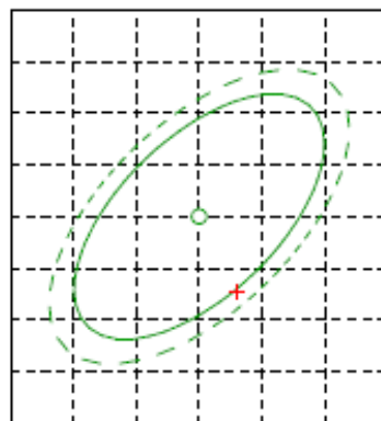
LUMINOUS INTENSITY DISTRIBUTION DIAGRAM