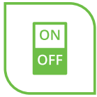
Turn Power OFF

1. Turn off circuit breaker that provides power to the light switch for the recessed lights.