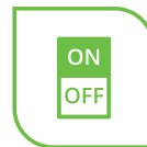
Turn Power ON

8. Push downlight into can until secure. Compression clips will hold retrofit light in place.