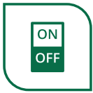
Turn Power OFF