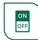
Turn Power ON