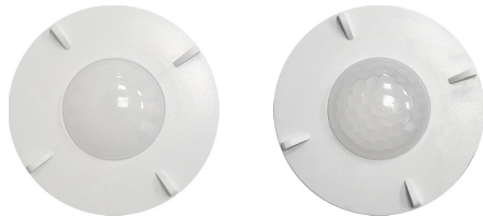
L1 Low Bay