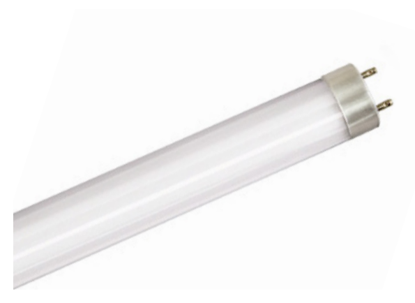
Item#: 54019 LED PLUG & GO™ LINEAR T8 REPLACEMENT LAMPS (PLUG AND PLAY) (UL TYPE A)