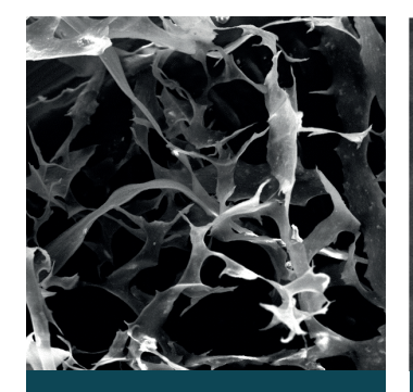
Lyophilized collagen - exhibits structural rigidity and stability

Optimal conditions must be determined for each application/assay.