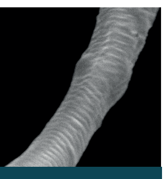
Collagen fibrils retain mechanical strength and elasticity