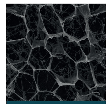
Pore sizes ideal for tissue engineering and drug delivery